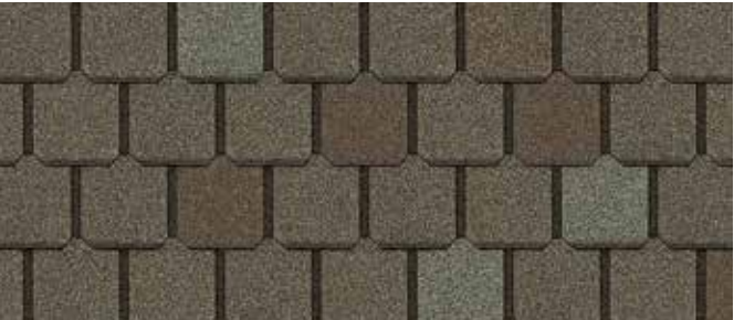
Sherwood Beige †