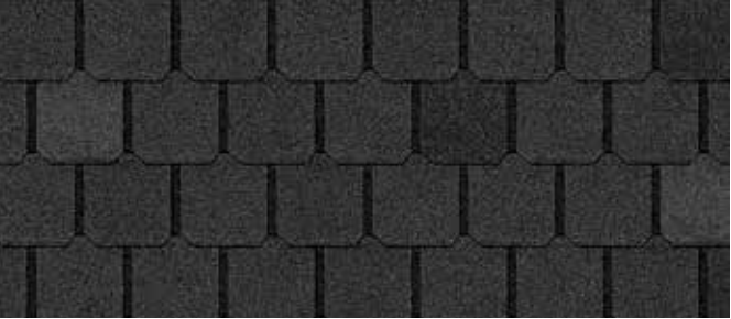
Canterbury Black †