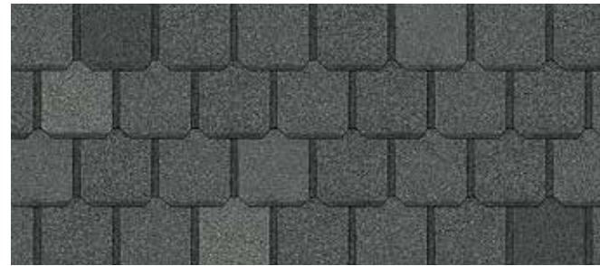
Manchester Grey †