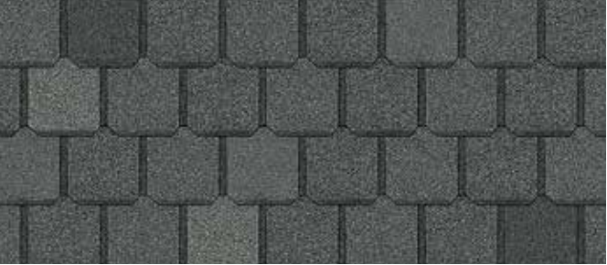
Manchester Grey †