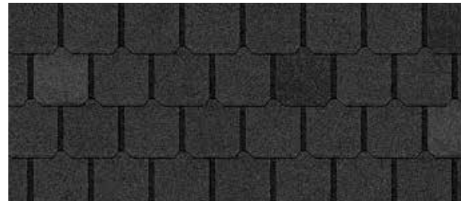
Canterbury Black †