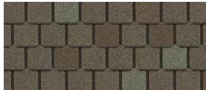
Sherwood Beige †