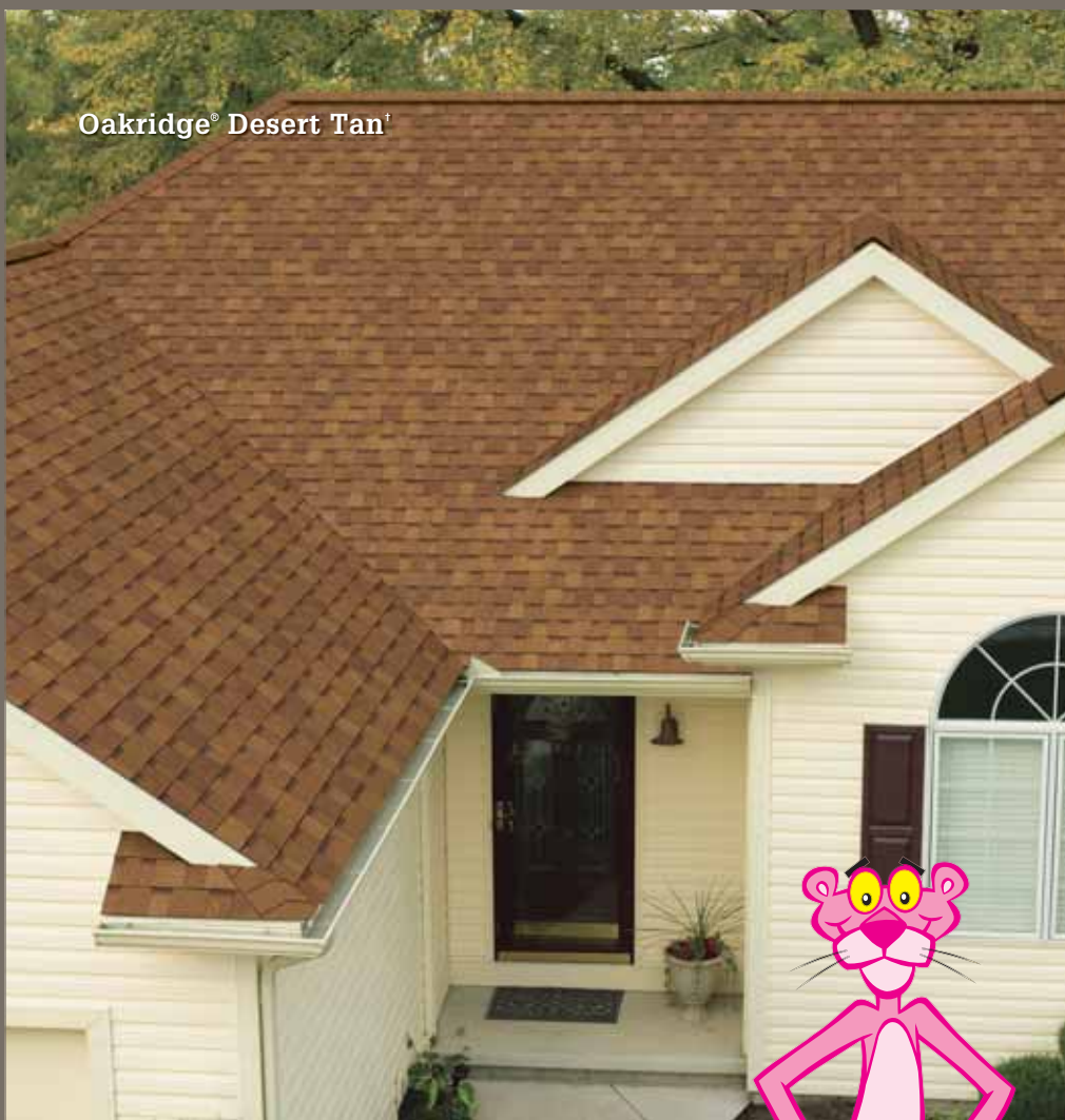
Oakridge® Desert Tan†