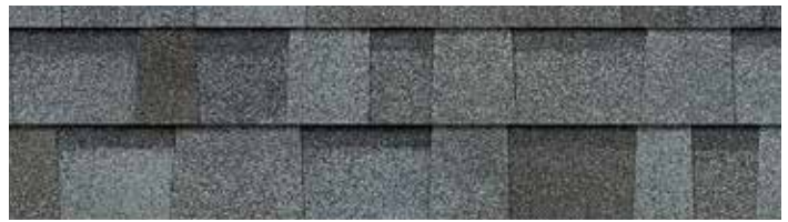
Quarry Gray †