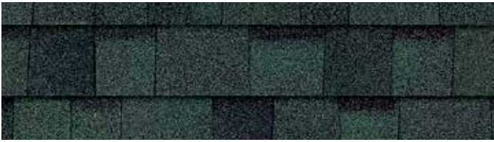
Chateau Green †