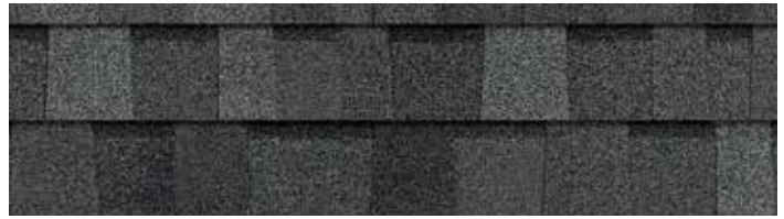
Estate Gray †