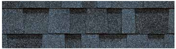
Harbor Blue †