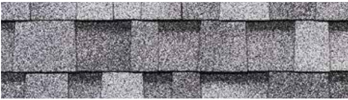
Sierra Gray †