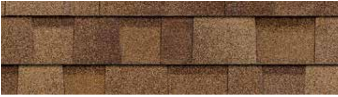
Desert Tan †

See map for colour availability in your area