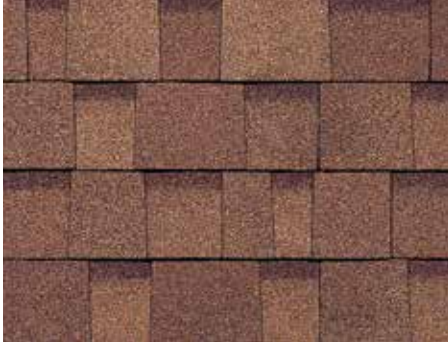
Desert Tan †

See map for colour availability in your area.