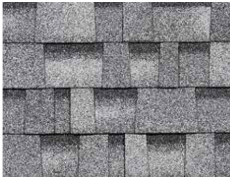
Sierra Gray †