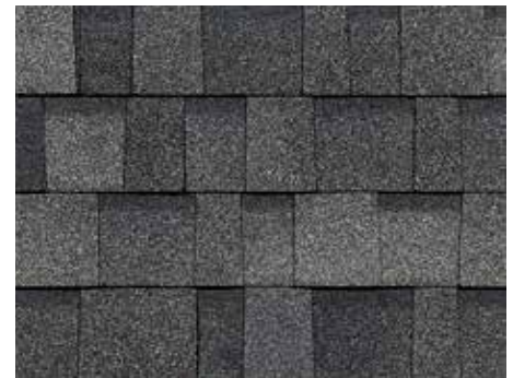
Estate Gray †