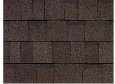
Teak † Colour Not Available in Region 4.