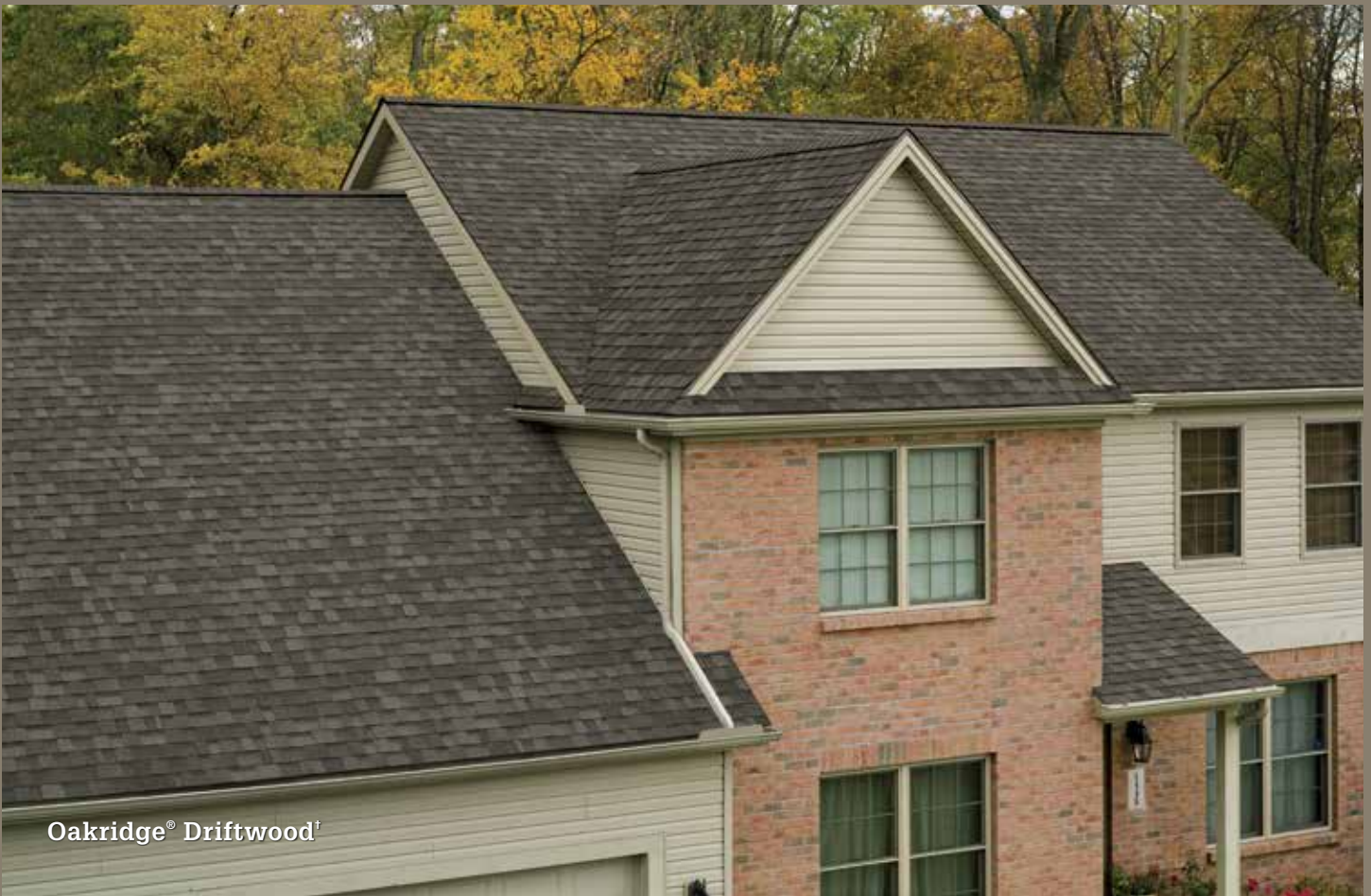
Oakridge® Driftwood †

Oakridge® Shingles are The Right Choice™ for long-lasting performance and striking beauty, in addition to a wide range of inviting popular colours. A Limited Lifetime Warranty* †† with 177/209** KM/H / 110/130 MPH Wind Resistance Limited Warranty* adds to this shingle's appeal.