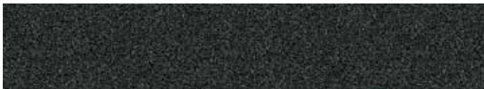
Onyx Black †