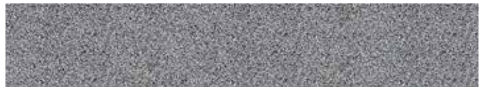
Sierra Gray †