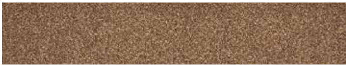
Desert Tan †