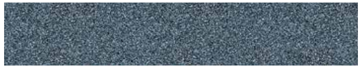
Harbor Blue †